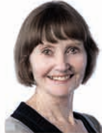
Di Sparks PR & Publicity