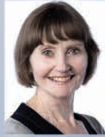
Di Sparks PR & Publicity